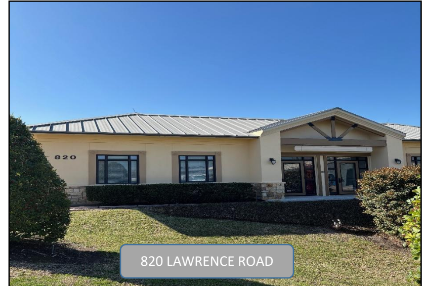
820 LAWRENCE ROAD