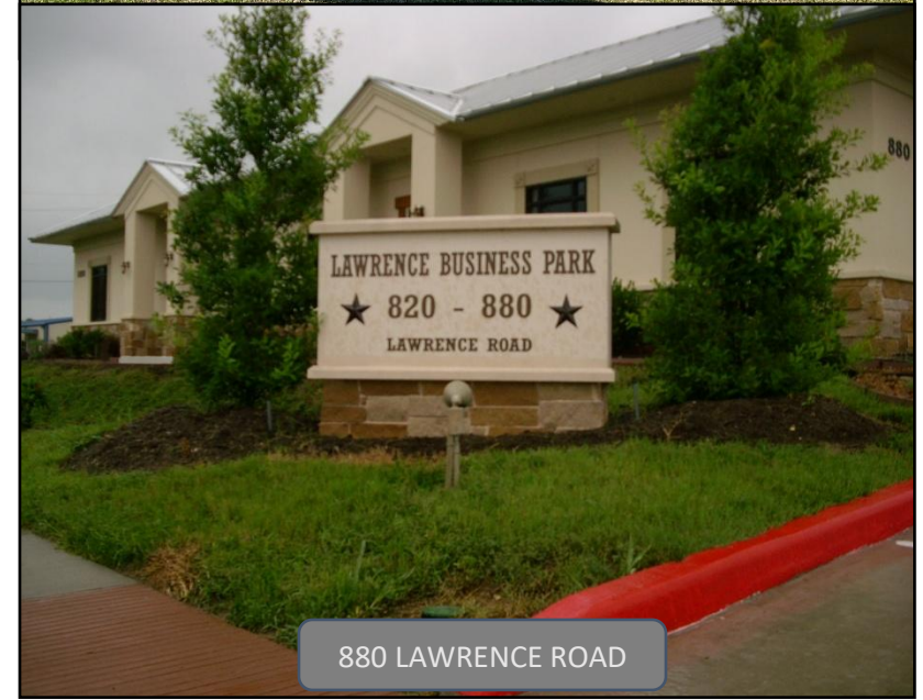
880 LAWRENCE ROAD