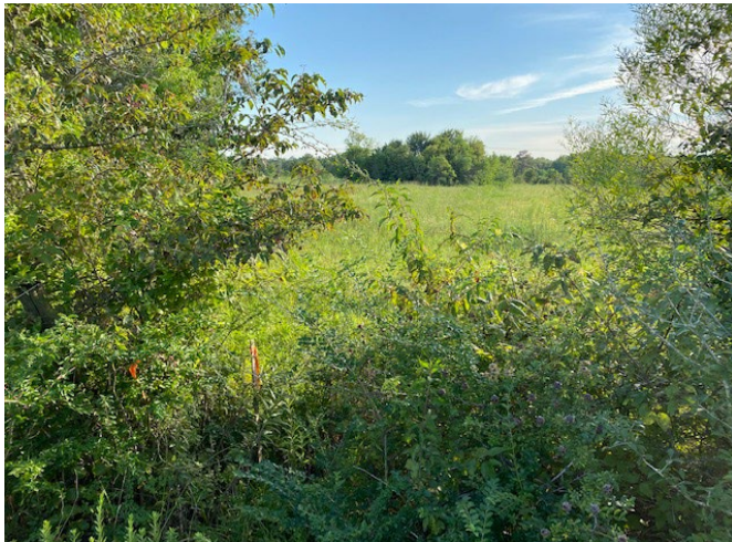
300 linear feet of frontage on SH 3