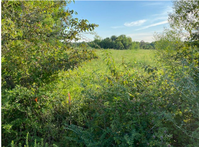
300 linear feet of frontage on SH 3