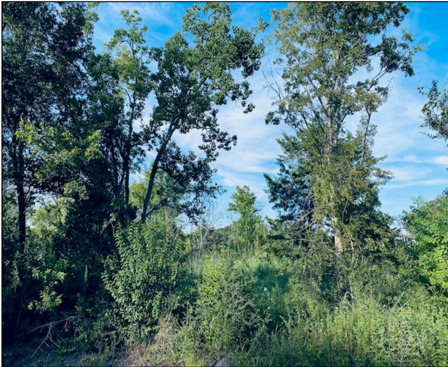
Corner of Mulberry and Arizona