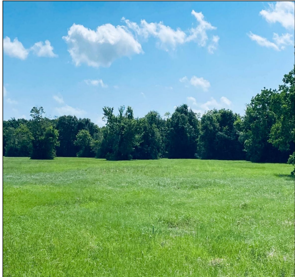
Well Water on site