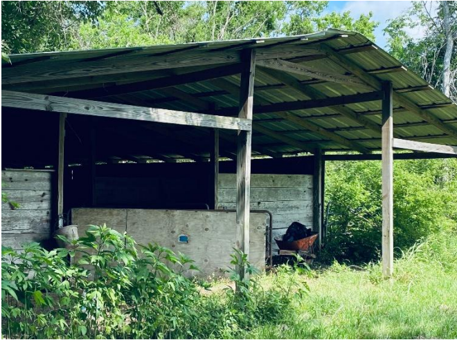
Barn on Property